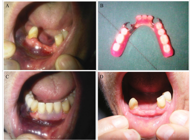
Figure 1. Preoperative view of the patient and removable dental prosthesis

Immobilization with previously used dental prosthesis can be used as an alternative, easy, quick and cost-effective method to stabilize dentoalveolar fractures in partially edentulous patients.