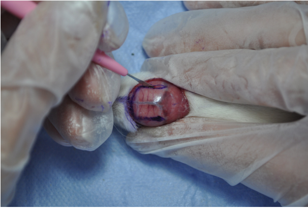
Figure 3. The blade simplifying incision with being small in the narrow surgical area