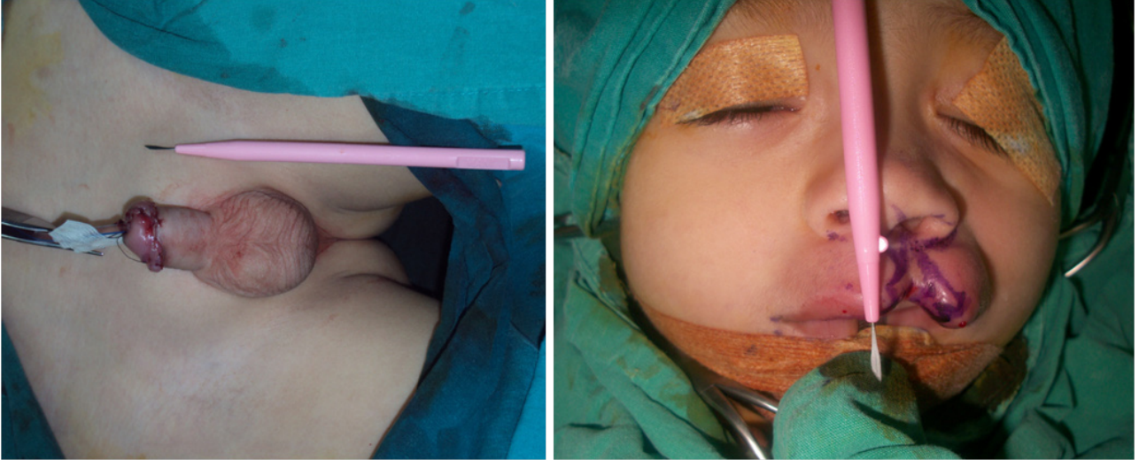
Figure 2. The knife serving an excellent incision and dissection in cleft lip and hipospadias surgery